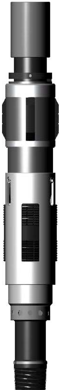
7" Anchor Catcher